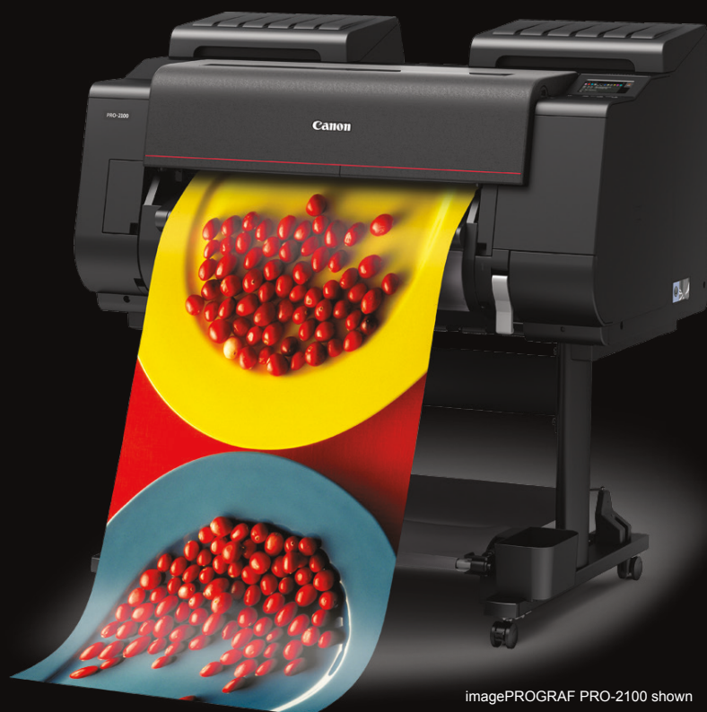
imagePROGRAF PRO-2100 shown

First, you can load a second roll of a different media type and size at the same time, allowing automatic switching from matte to gloss paper without interrupting your workflow. Or second, you can configure the printer as a bi-directional take-up unit.