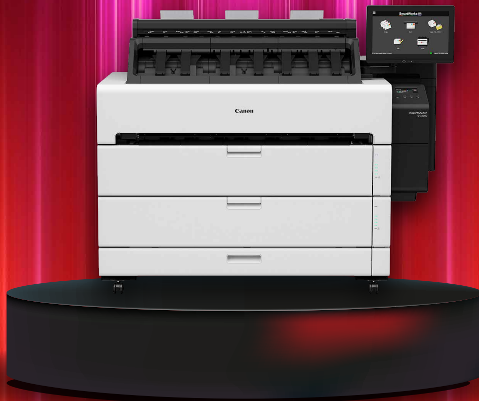
imagePROGRAF TZ-32000 MFP Z36