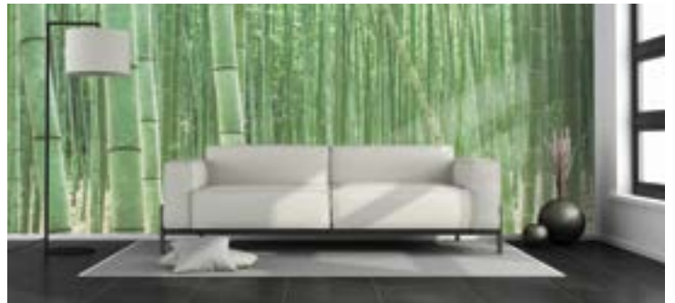
Photo wallpaper, on the other hand, looks best with a high-gloss finish that makes the colors pop. Give your customers realistic photo images that inspire.