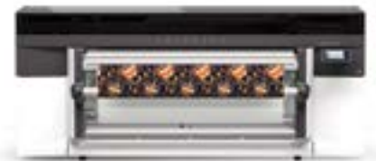
Océ Colorado 1650 printer